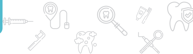
EXHIBIT AT IDEM 2020