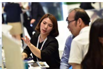
Exhibitor Presentation Programme